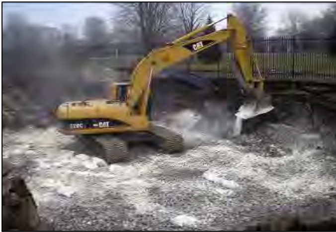
Direct application of EOx™ powder to soils.

EOx™ is economical and offers considerable capital cost savings over other commercially available "advanced" oxygen-releasing compounds. EOx™ helps nature take the lead by stimulating bacteria that biodegrade the hydrocarbons contaminating your site. EOx™ technology quickly remediates your site allowing it to be returned to use or re-developed sooner than many other approaches.