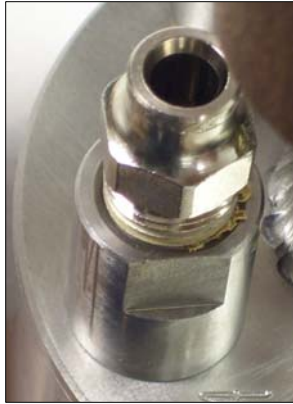
Air Inlet Push-To-Connect 1/4 in I.D. Hose / Tubing.