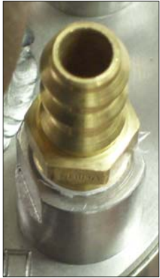
Exhaust Hose Barb 3/8 in I.D. Buna-N