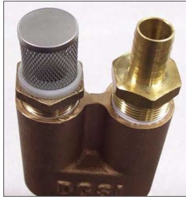
Fluid Discharge Hose Barb 3/4 in I.D. Buna-N Hose

Warning: All tubing or hoses attached to the pump must be secured with an appropriately sized hose clamp.