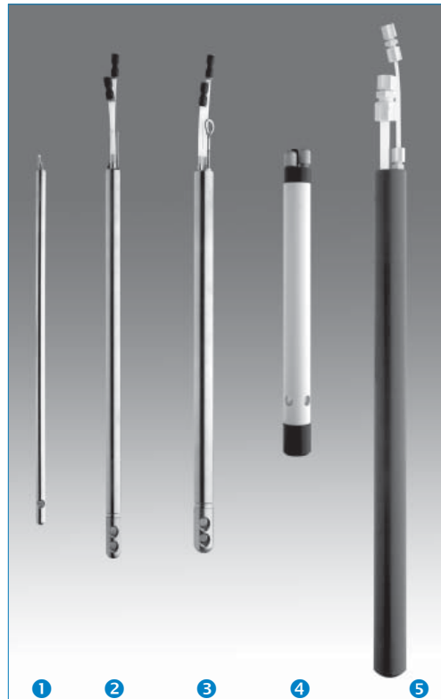
Models for wells down to 1/2 in and depths to 400 ft. Stainless Steel or PVC.

Tech Tip: In portable applications, the pump is easily decontaminated by submersing it in a cleaning solution such as Alconox®. Then the pump is cycled to circulate the solution through the internal components. This method avoids the need to replace bladders after each use.